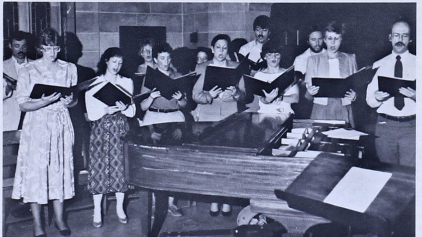
Instrumental and vocal music, including that of the CTS Choir.