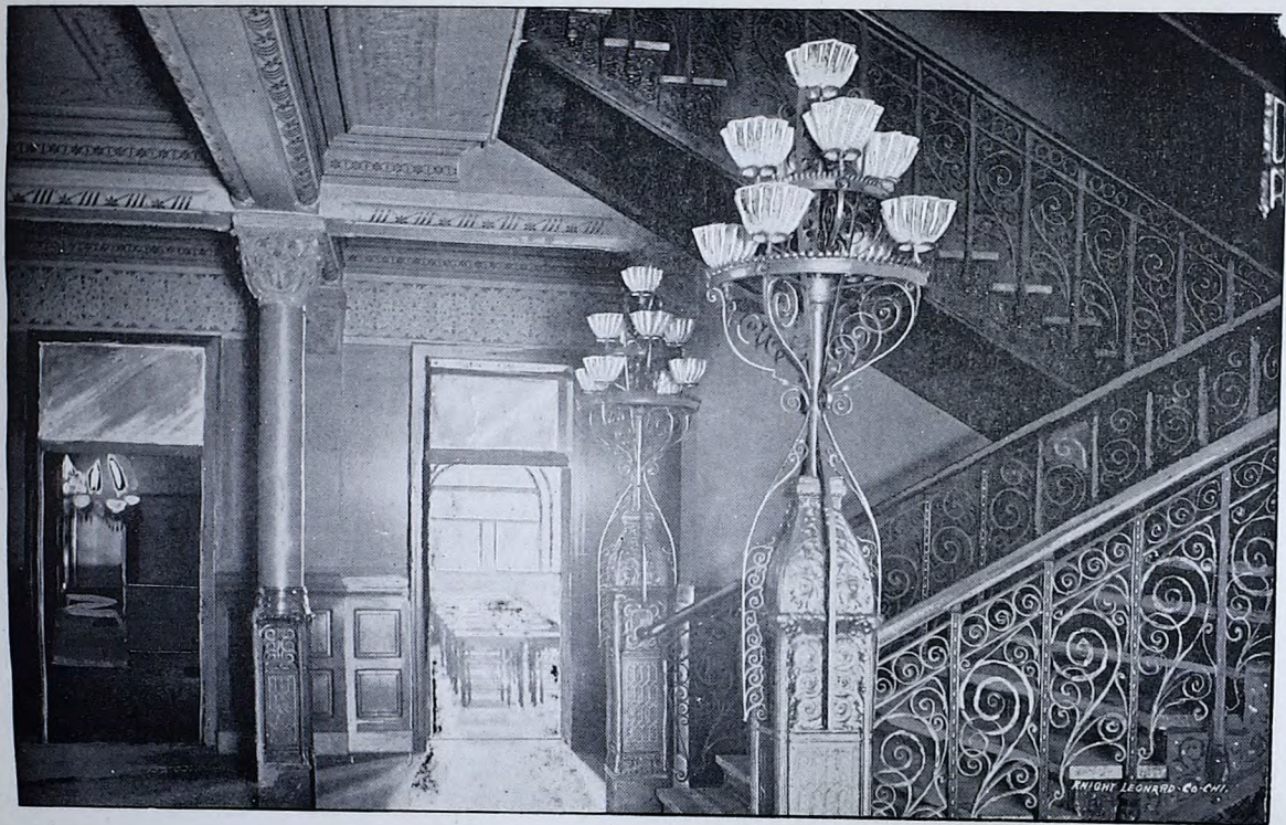
CORRIDOR, FISK HALL.